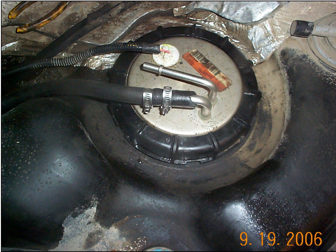
Figure 13 – New Fuel Line Double Clamped on Pickup Tube (Excursion Shown)