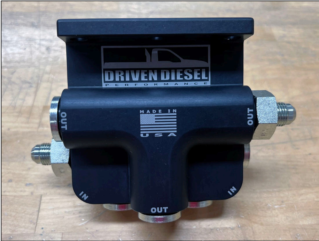
Figure 11 – Filter Head with Fittings and Plugs – Inside the Frame Flow Direction