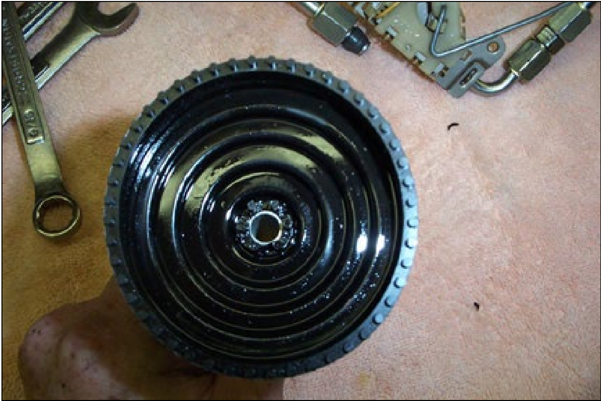
Figure 9 – Pickup Extension Tube Fit