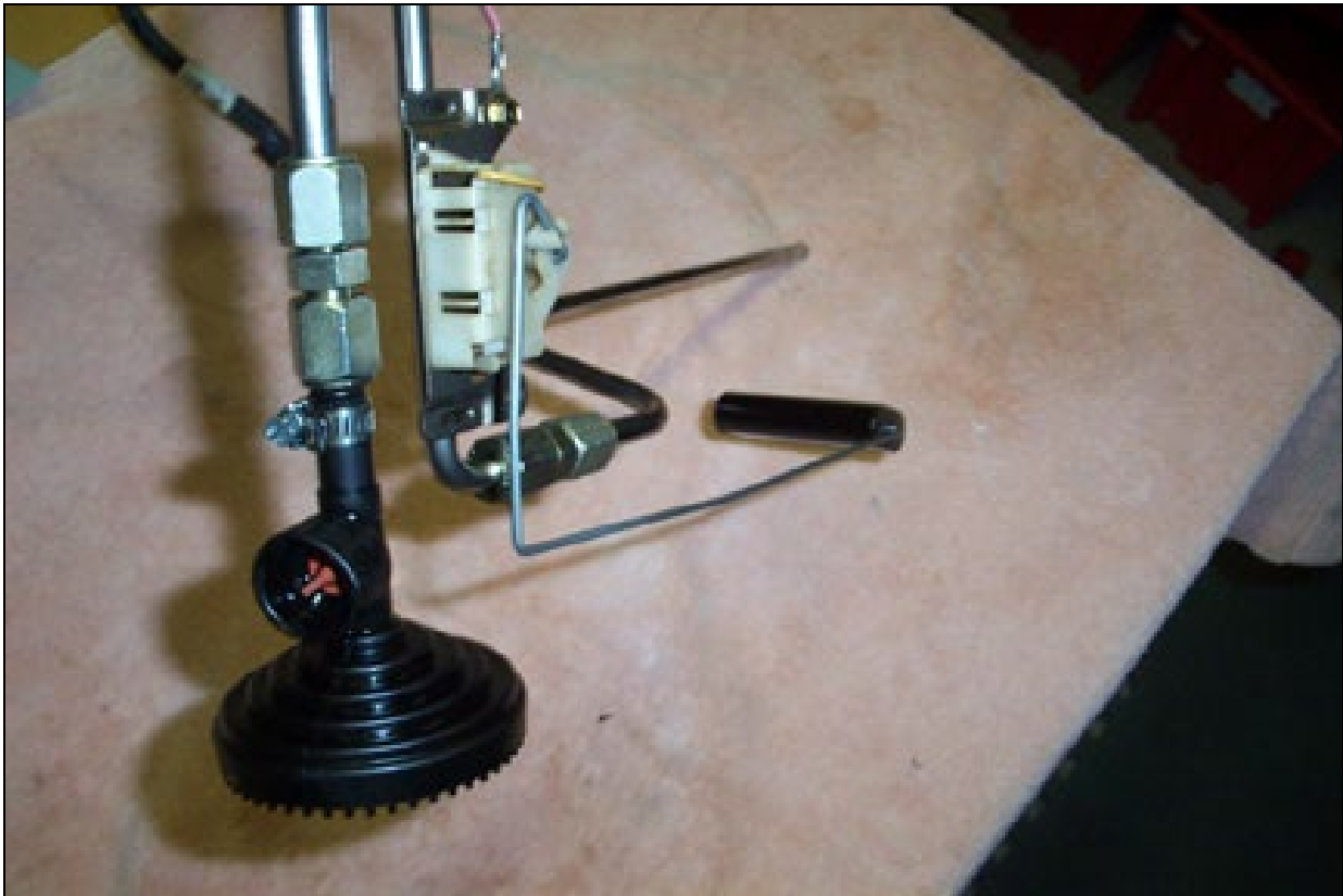
Figure 10 – Sending Unit Assembly Ready for Installation