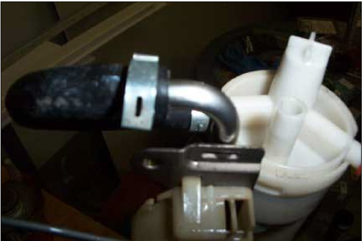
Figure 4 - Cutting the Hose Clamp