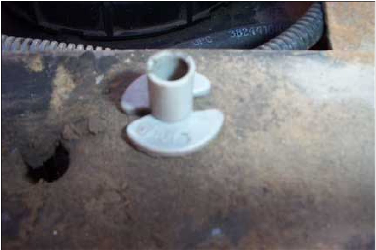
Figure 1- Line Release Tool (there are other styles)