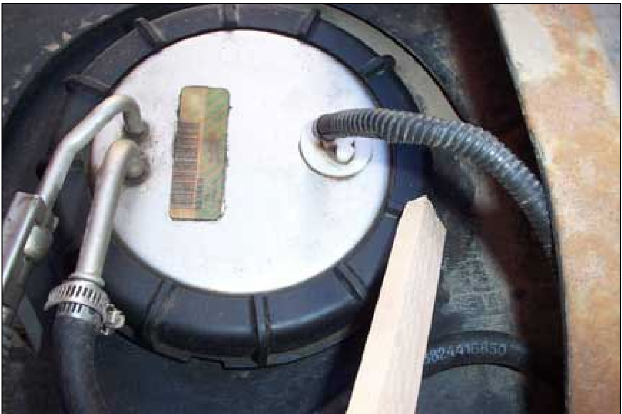
Figure 2 - Removing the Retainer Ring