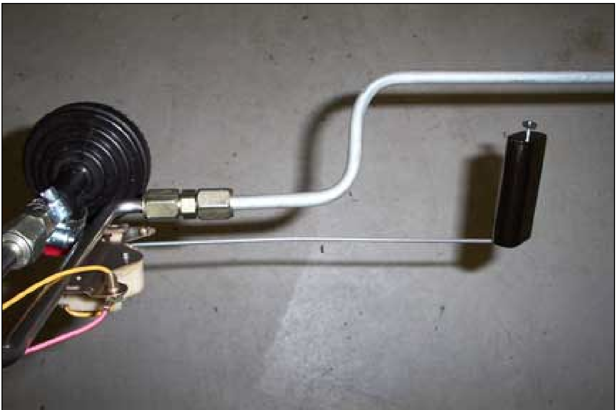
Figure 6 – Return Tube Installed