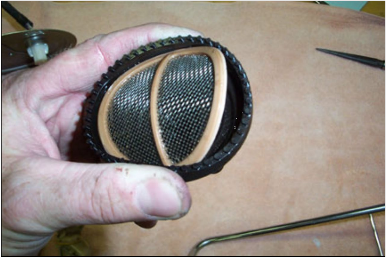
Figure 7 – Removing Filter Screen from Pickup Foot