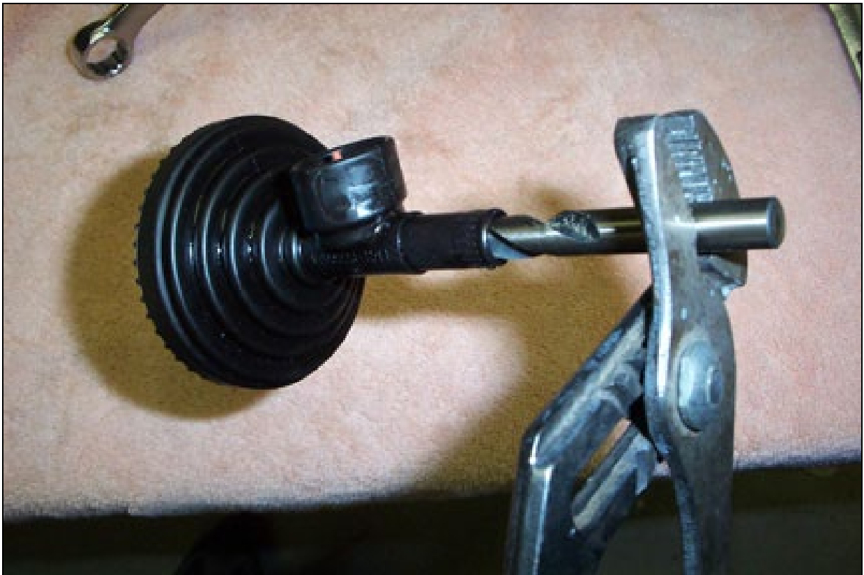
Figure 8 – Opening Up Pickup Foot with 3/8" Drill Bit